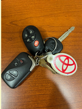
car keys for a Lexus and a Toyota