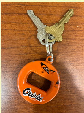
We also have a set of keys attached to an Orioles beverage opener