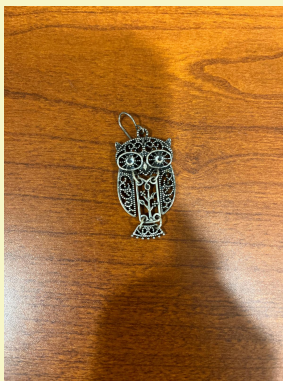
a cute little owl