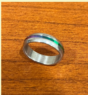
and a ring in search of a finger

They are in foster care in the office until the end of September.