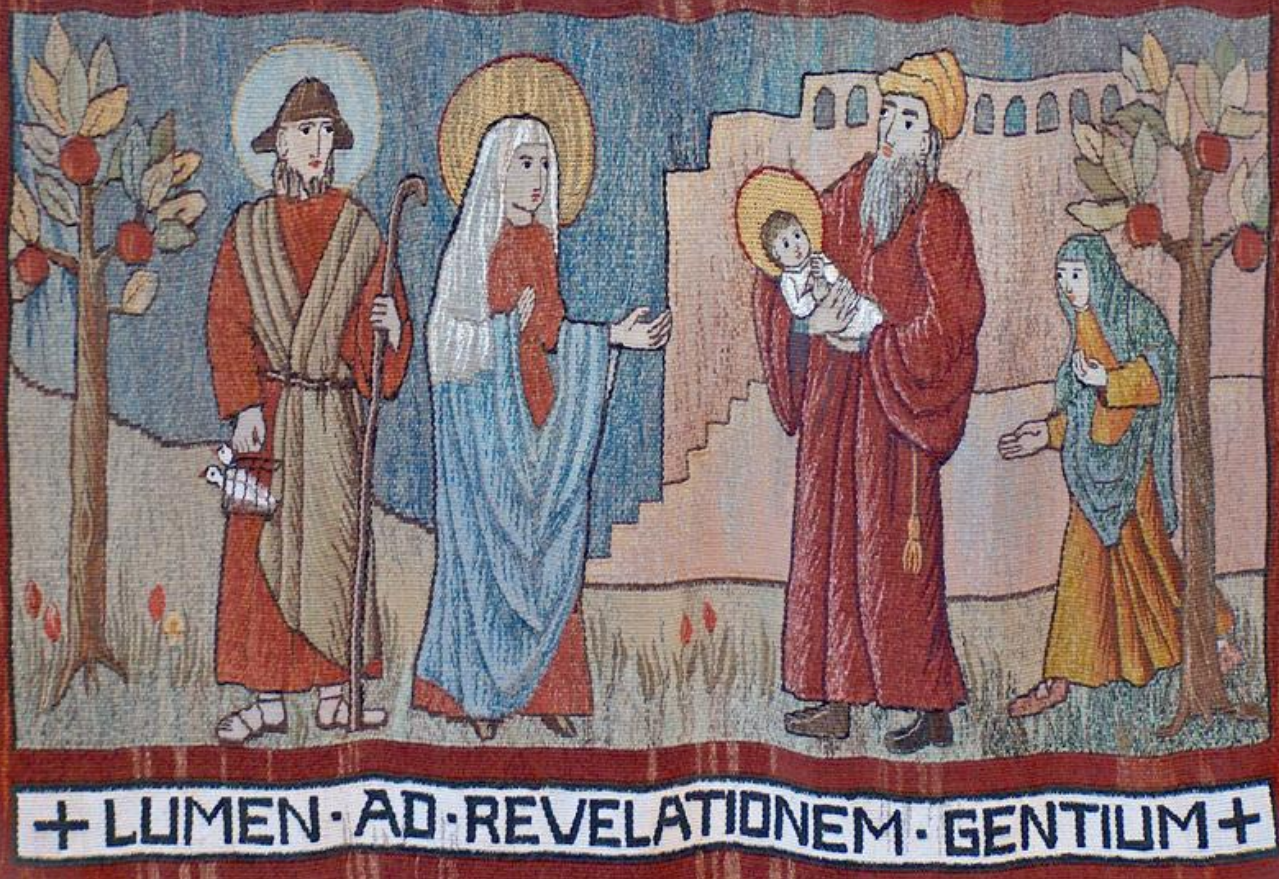
Presentation in the Temple / Abbey of St. Walburga / 1990