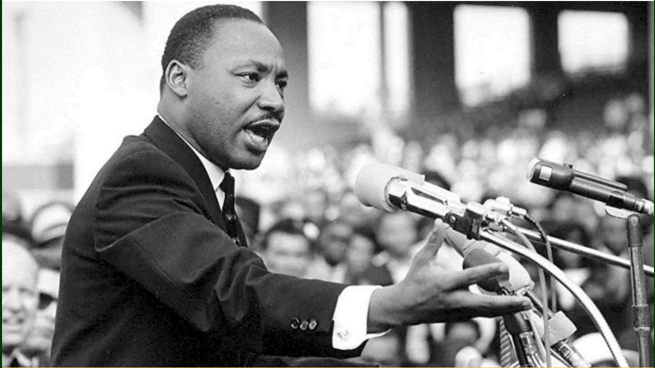
Martin Luther King, Jr. : January 15, 1929 - April 4, 1968